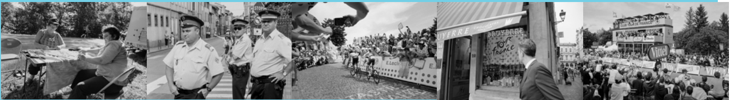
photographs from different years between 2005-2025

Alongside my commissioned work, I have been developing over the years this long-term analog personal project “ALLEZ LE TOUR!” - starting in 2005 . It began on the roadside of the Tour de France and has grown into an ongoing visual archive of everything that happens just outside the frame of the race itself. I photograph exclusively on black-and-white 35mm analogue film – a conscious decision to slow down, to trust experience, and to stay connected to the physical act of photography.