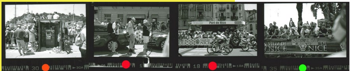
Extract from contact sheets 2024 Nice, France (in process of digitalisation)

Right now I am in the process of selecting more material that will be in the next edition of the book and quite some of it is already in the process of digitilising. This is a process I really enjoy, but it does take a lot of time as well and has to be done next to all other work – so sometimes its challenging to prioritize. But I do hope to get everything ready soon, as the next Grand Depart is in Barcelona.